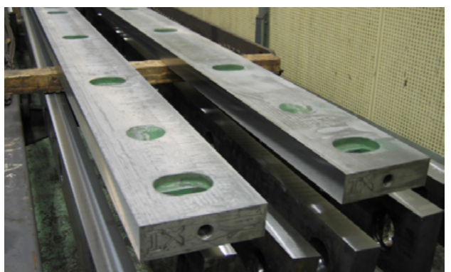
Fig 2. Toolox® 44 shear blades

All long flat pieces are very suitable Toolox® applications. Toolox® is tempered at 590°C, which removes all stresses from the steel, making it possible to obtain remarkable precision when machining. An example is shown in Fig 2, where shear blades are used for cutting high strength plates.