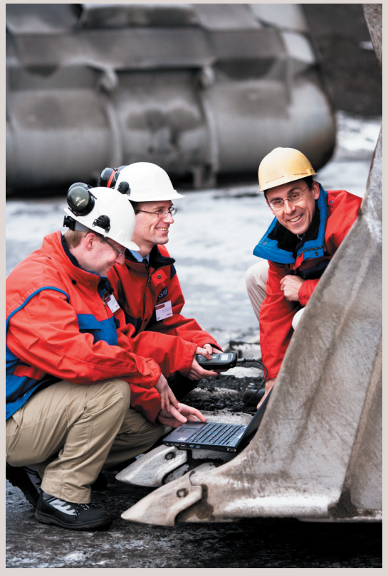
Conquering wear through applied technology.

SSAB Oxelösund has formed the Wear Technology Group<sup>™</sup> (WTG) to bridge the gap in wear knowledge. They help you choose the best materials for your applications and get the highest wear performance possible, for example when it comes to service life and pay-load.